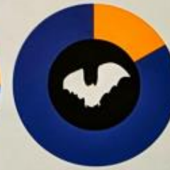
brown bat 20 hours of sleep