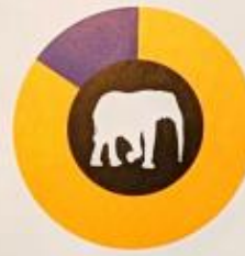
elephant 3½ hours of sleep