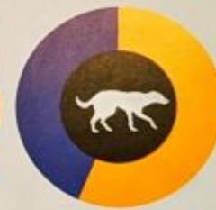
dog 10½ hours of sleep