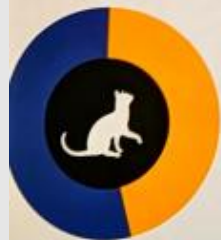
cat 13 hours of sleep