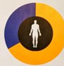
human 8 hours of sleep