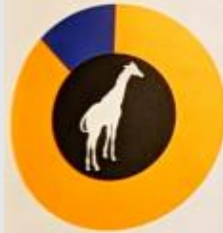
giraffe 2½ hours of sleep

How many hours in a 24-hour day do animals sleep?