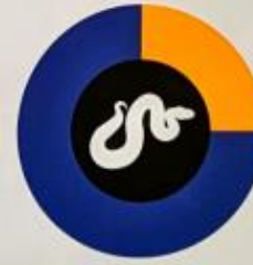
python 18 hours of sleep